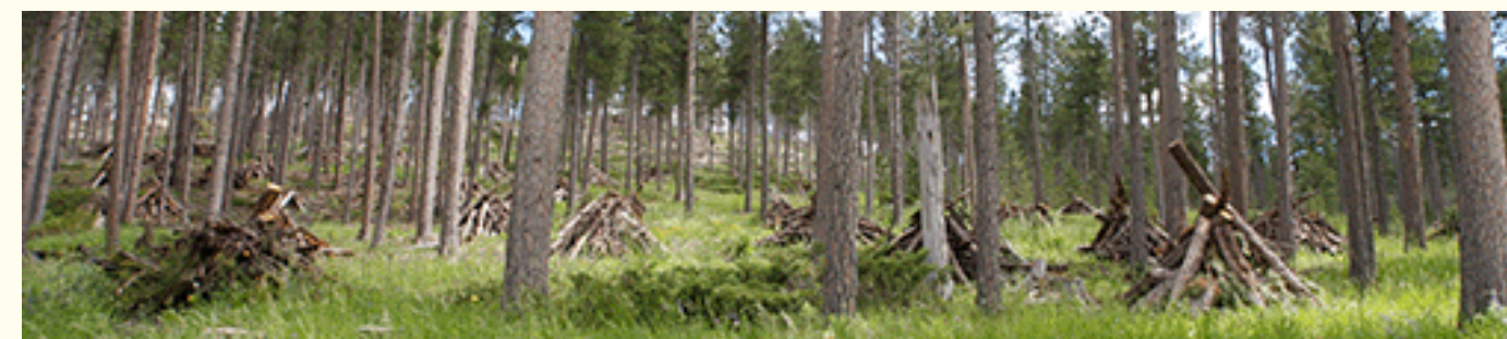
Timber Sustainability on the Black Hills National Forest

Enjoy yourself while viewing the many rugged rock formations, canyons and gulches, open grassland parks, tumbling streams, and deep blue lakes. Millions of visitors come to the Black Hills each year to experience the rich and diverse heritage.